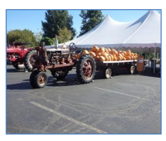
Pumpkins galore at Hubers

Our final night in Indy would take in dinner at the Skyline Club, a most distinguished private business club atop The One America Building, (Indy's highest), sitting on the 36<sup>th</sup> floor overlooking the city and the giant Lucas Oil Stadium where the Indianapolis Colts were playing the New York Jets at football.....sadly they got trounced – from the Club we could just about see the action on the large screen inside the stadium, thanks to the open roof. The views from the restaurant overlooking Indianapolis, particularly at night are most striking. A most pleasant evening in congenial company, an imaginative menu with very agreeable wines – unfortunately the writers notes on menu and wines