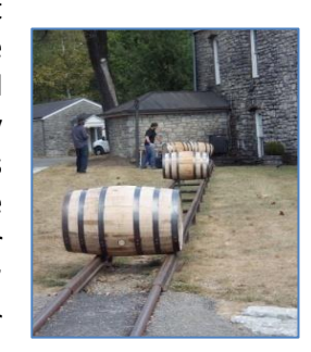
Barrels of matured bourbon are rolled down to the bottling room

presentations are well rehearsed, slick and professional and although there are obviously set