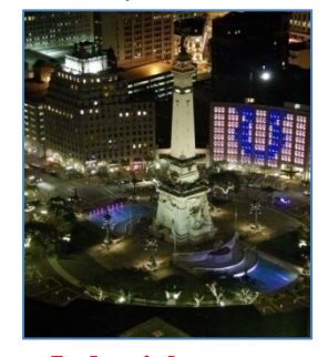
Indy night scene the elaborate "Monument Circle" as seen from the Skyline Club

For some strange reason, it would have appeared that the Scots reputation for "the appreciation of wine and spirits" had some influence on our hosts for next on the agenda was a visit to a local craft brewery! The St Joseph Brewery (www.saintjoseph.beer) had taken over a disused building in