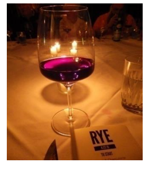
A rather pleasant 2011 Napa Valley Cabernet Sauvignon at the Rye