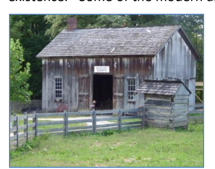
The blacksmiths shop or "Smiddy"......

and a wigwam) on the myriad of American tribes, their cultures and existence. Some of the modern art was of less interest to the writer,